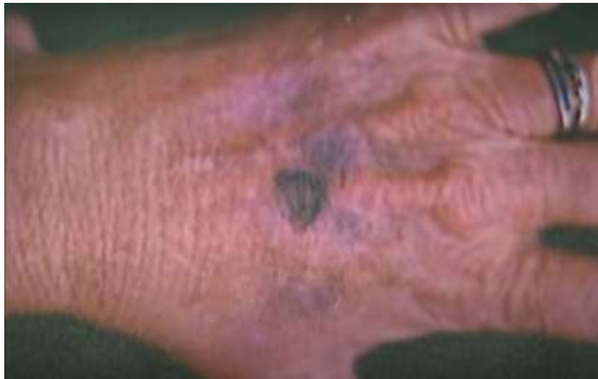
Photograph of Vickie's left hand, as shown in numerous print publications and television shows, including The Unexplained

On the same show, Vickie explains that after the craft and helicopters "flew [away] slowly toward Houston" (at 22:08), about 13 km into the resumption of their drive home "there was [another?] whole bunch of [the big kind of] helicopters that were flying in with their searchlights on. They flew over us" (23:12). A photograph of what the narrator misidentifies as the "badly burned [hand of] Betty Cash " (23:26) shows an area resembling a dark purplish triangle on the back of Vickie's left hand (a newspaper photo's caption at 31:25 correctly names Vickie).